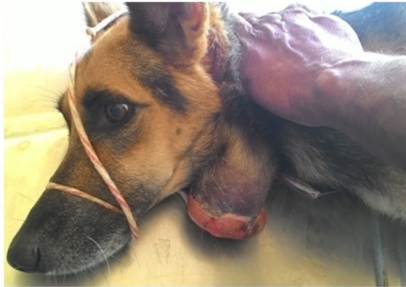
Fig-1: Photo showing an ulcerated mass on ventral aspect of neck in a German shepherd dog