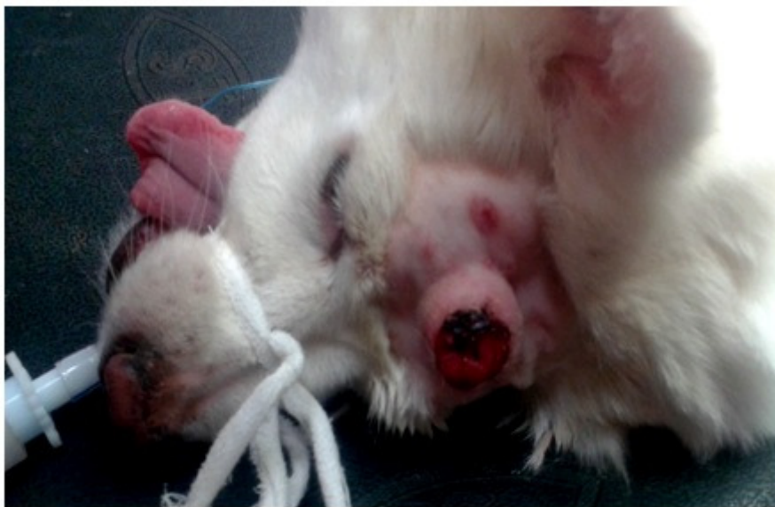
Fig-2: Photo showing an ulcerated mass on dorsal aspect of skull in a Pomeranian dog