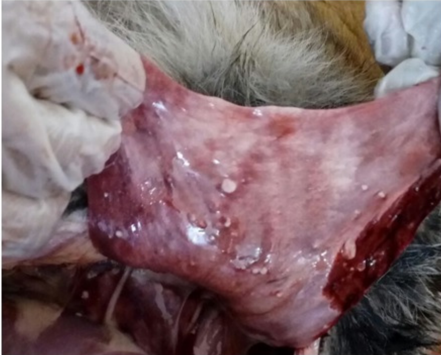
Fig-5: Photograph showing multiple nodules on the lung in a German shepherd dog during autopsy