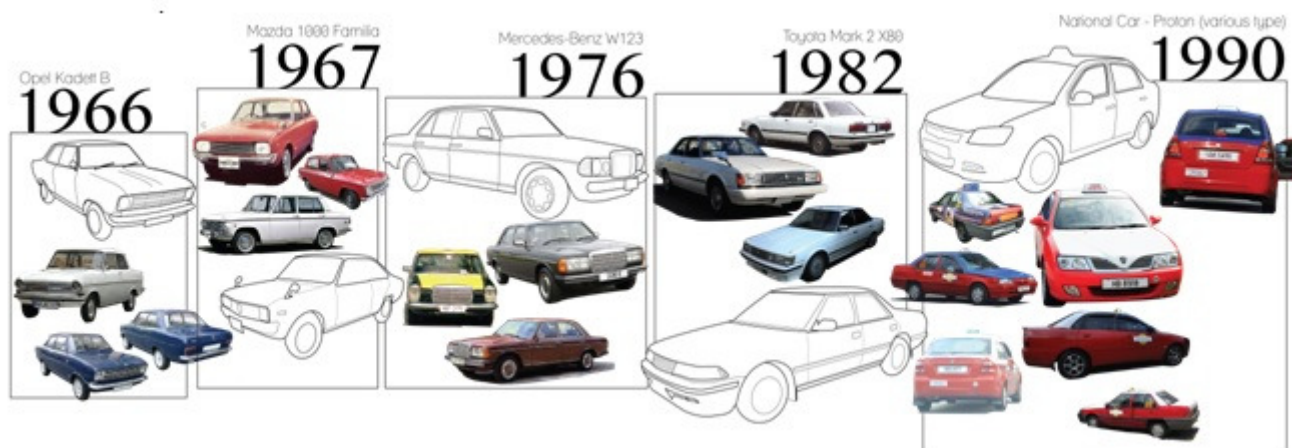
Figure 2: Type of taxi used in Malaysia since its operational time started in 1966 11

Today, most taxicabs found in Malaysia are from the national "local" car manufacturers e.g. Proton Saga BLM, Iswara, Wira, Waja, Naza Citra and from foreign car manufacturers e.g. Japan and Germany. The taxis are operating for various types of services in various locations all over Malaysia. The major consideration is why Malaysian authorities, in this case is the Public Land Transport Commission (SPAD) for granting these types of cars for taxi use, is to give the best user experience especially in comfortability and worthiness. Before the start of local car production in 1983-1986, the Mercedes-Benz 200, Mazda 323 of Ford Laser, Toyota Mark II X80 series and Opel Kadett were used. In 1989, most of the taxis were discontinued and Malaysian Taxi services start to use the national cars as their main taxis operating in the cities.