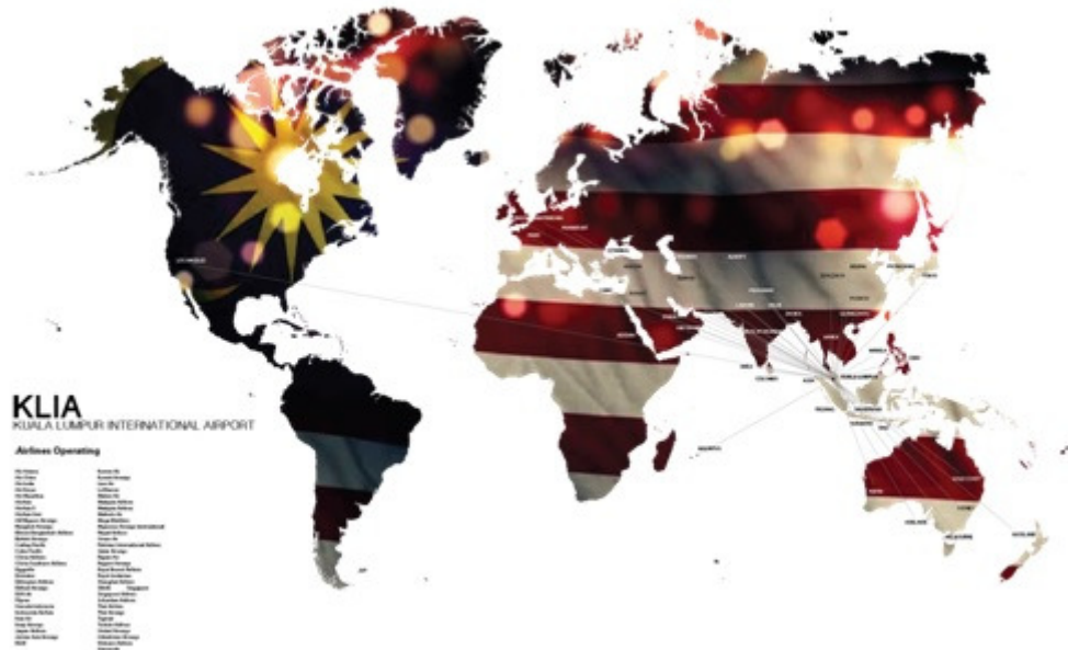
Figure 1: Showing that there are visitors or tourists around the globe who visits Malaysia based on the airport travel route. Source: http://www.malaysiaairports.com.my/

In conjunction with the increasing number of visitors visiting Malaysia, and a massive income generated from that, what does the taxi service had something special to offer? Based on figure 1, there are lots of taxi journey that will need to be provided to the tourist visiting Malaysia. It is important to have a special image, or specific branding strategies for Malaysian taxis, to clear up their bad reputation based on their services 1 . Brands will create an extraordinary and emotional bond between the preferred travellers and the destinations 15 . Ironically, brand also promises a travel experience that will drive to the elements of the destinations excitements 7 .