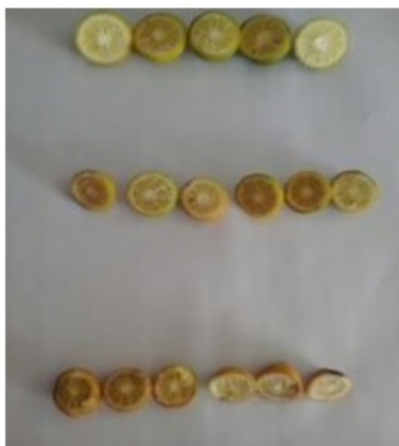
Fig. 3 Horizontal Section of stages of fruit drop Nagpur mandarin