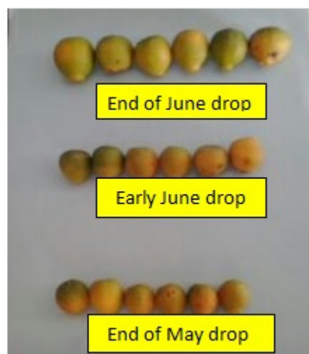
Fig.4. Overview of fruit drop stages in