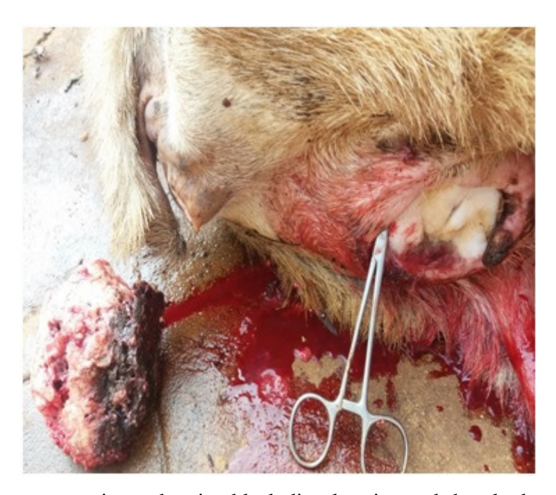
Figure 2: Gangrenous tissue showing black discoloration and sharply demarcated from unaffected area