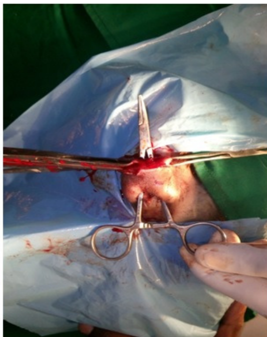
Fig: 2. Photograph showing passage of artery forceps through recto-vaginal fistula