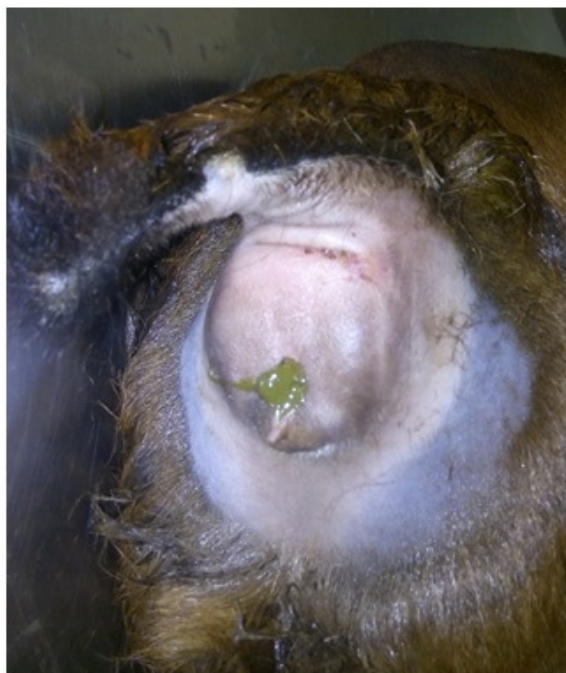
Fig: 1. Photograph showing passage of dung through vagina and bulging at the base of tail due to atresia ani.