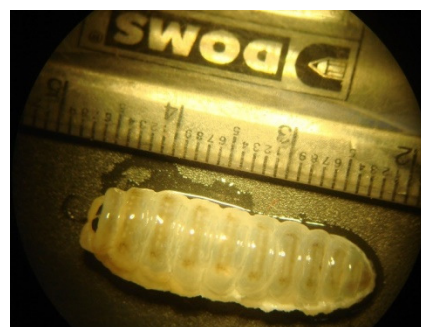
Fig. 2. The Larva of O. ovis