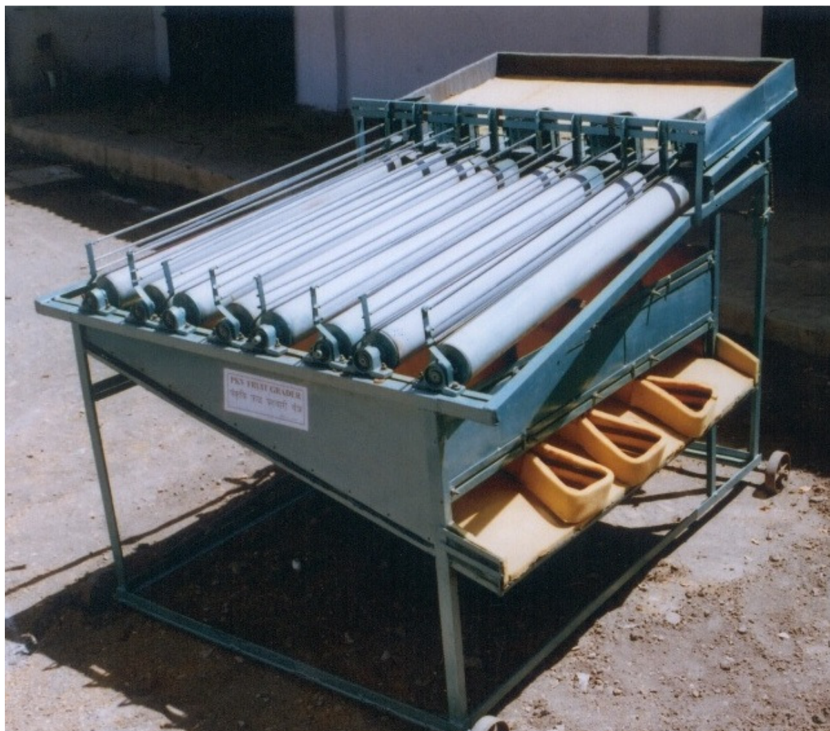
Fig.1 PKV Fruit Grader developed at Akola Center

The second order polynomial equation of the following form can be assured to appropriate the true functions.