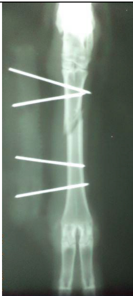
Fig-7: Radiograph showing fracture healing of metacarpal treated with free form ESFusing acrylic material on 1st, post-operative day