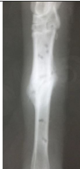
Fig-8: Radiograph showing fracture healing of metacarpal treated with free form ESFusing acrylic material on 48th post-operative day.