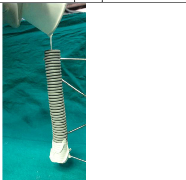
Fig-4: Photograph showing pouring of semisolid acrylic material into corrugated tube