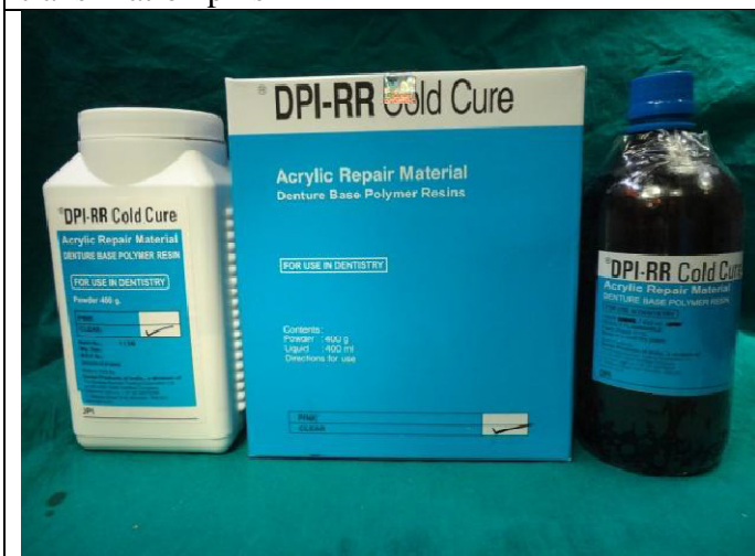
Fig -3: Photograph showing commercially available Acrylic Repair Material(DPI-RR Cold Cure)