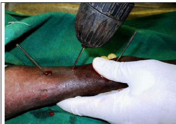
Fig.-1: Photograph showing placement of transfixation pins

[21] Singh AP, Mirakhur KK and Nigam JM 1983. A study on the incidence and anatomical locations of fractures in canines, caprine, bovine, equine and camel. Indian Journal of Veterinary Surgery 4(1): 61-66.