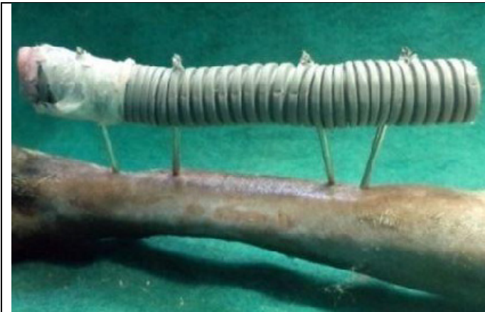
Fig-5: Excess parts of the transfixation pins cut close to the acrylic bar