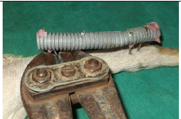
Fig-6: Cutting the pins close to the acrylic column