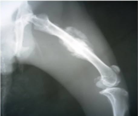
Fig 7. Note hard callus formation bridging of fracture gap in PMMA group by day 30.