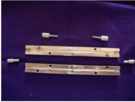
Fig 3: Mold used to prepare the PMMA implant