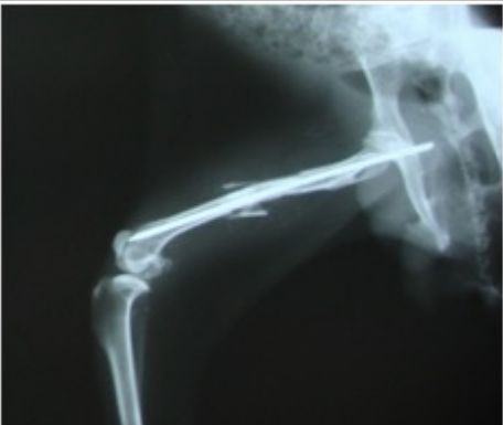
Fig 5. Note Secondary fracture with pin migration in control group.