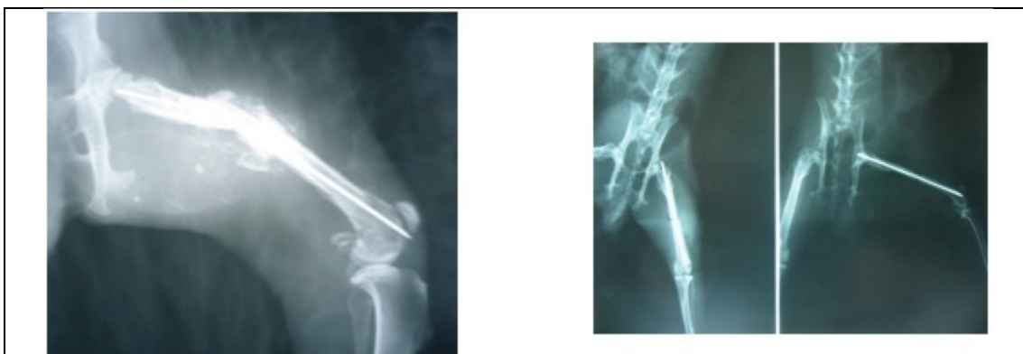
Fig 9. Note exaggerated osteoinductive activity by day 30 (HA)