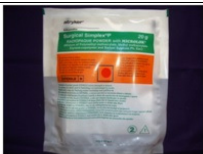
Fig 1. PMMA Powder