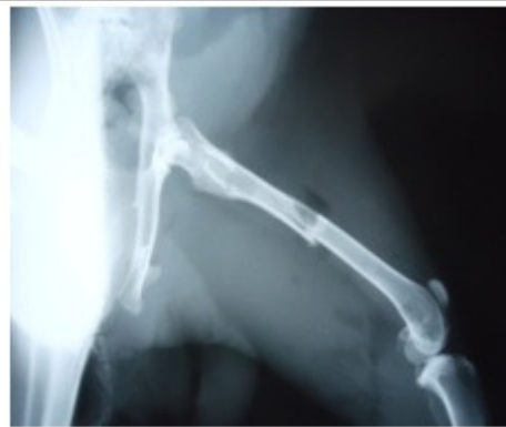
Fig 6. Note mild osteolytic changes in the proximal fragment in group I.