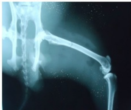
Fig 8. Note near normal bone healing in PMMA group after 60 days.