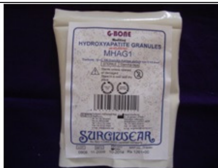
Fig 2. Hydroxy apatite granules