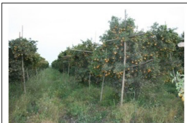
Fig 2: Importance of bamboo in Citrus orchard

Carbon sequestration in different agro-forestry systems occurs both belowground, in the form of enhancement of soil carbon plus root biomass and aboveground as carbon stored in standing biomass.