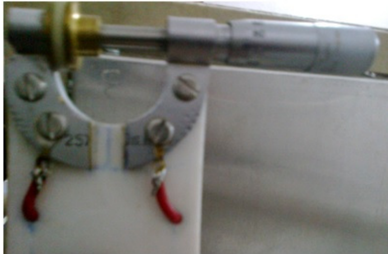
Fig. 2: Jig

A commercial digital LCR meter (Systronics, SDLCR 925) was used to measure the capacitance and dissipation factor ( \tan\delta ). To have a comparative study of dielectric behaviour of femur, rib and scapula in the applied alternating field of frequency 1 kHz capacitance and dissipation factor were measured with and without the sample in the cell. All the measurements were taken at room temperature. The dielectric constant of the sample is given