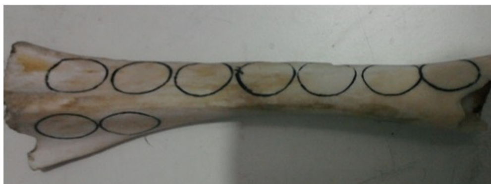
Fig. 1: Specimens (pellets or discs) were cut from mid region of the bone

Fresh bones such as femur, rib and scapula of ox and camel were collected from slaughterhouse for present investigations. Fleshly material present on the bone is removed. Specimens (pellets or discs) were cut from mid region of the bone (Fig. 1).