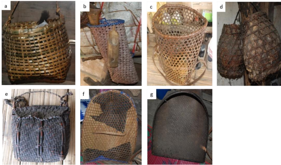
Fig. 3. Different types of bamboo handicraft items from the study areas. (a) Dueng (carrying basket), (b) Yokpur (Sword carrier), (c) Chuga (carrying basket), (d) Edung (liquid storage container), (e) Hokiap (bag for carrying fishes during fishing), (f) Abong (rain shield) and (g) Epo (winnowing tray)

fishing equipment such as poles and baskets are also made from bamboo. Other household items such as mats, shoulder bags, hats, vessels, mugs with carvings can also be seen being made out of bamboo and canes. The communities have mastered the technique of basketry, and the designing of such items among the villagers has been found to be entirely based, practical and are aptly suit to their socio-cultural and geographical landscape (Singh et al. , 2008).