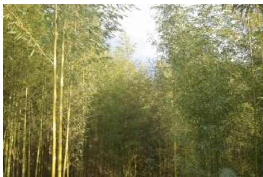
Fig. 2. Bamboo garden of Apatani plateau

with long creeping rhizomes. It is primarily cultivated in the bamboo groves (Fig. 2) and is used for various purposes in the community ranging from food source to religious rituals.