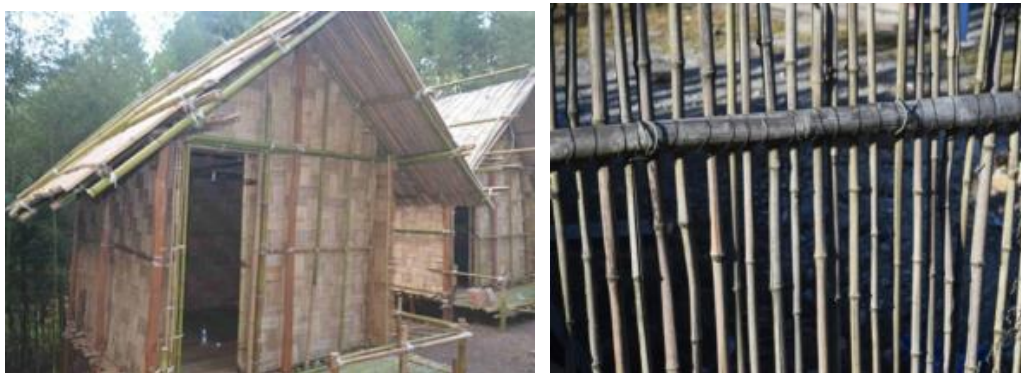
Fig. 4. Use of bamboo in house construction (left) and fencing (right)

Bamboo species Dendrocalamus hamiltonii , Dendrocalamus hookeri , Bambusa pallida and Bambusa tulda are mostly employed in a traditional house construction by the Adi tribe (Singh et al. , 2008). The walls, floor and ceiling of the traditional house is made out of bamboo. The leaves of toko-patta ( Livistona jenkisiana Griff.) are used after proper drying as a roofing material for local houses (Singh et al. , 2008). Bamboo is also a popular choice for fencing material to cover the boundaries of house, kitchen gardens and fields. Bamboos are used in making shed for the livestock, poultry and piggery.