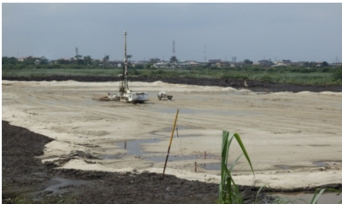
Figure 2: Reclaiming of Mangrove at a site in the study area

However, these problems could be exacerbated by the influx of human population in Lagos, where the study area is situated, and is inextirpable, and now is considered the most populated city in Nigeria in terms of human population (Pelemo et. al. , 2011, NPC 2011, Ayeni 1979).