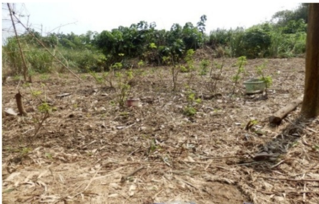
Figure 3: Land clearing for subsistence farming behind the Faculty of Environmental sciences

However, these problems could be exacerbated by the influx of human population in Lagos, where the study area is situated, and is inextirpable, and now is considered the most populated city in Nigeria in terms of human population (Pelemo et. al. , 2011, NPC 2011, Ayeni 1979).