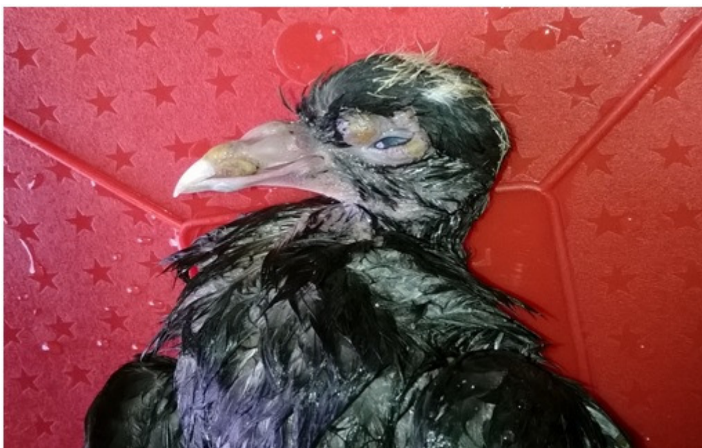
Fig. 1: Grayish white nodular lesions on Beak and around eyes.