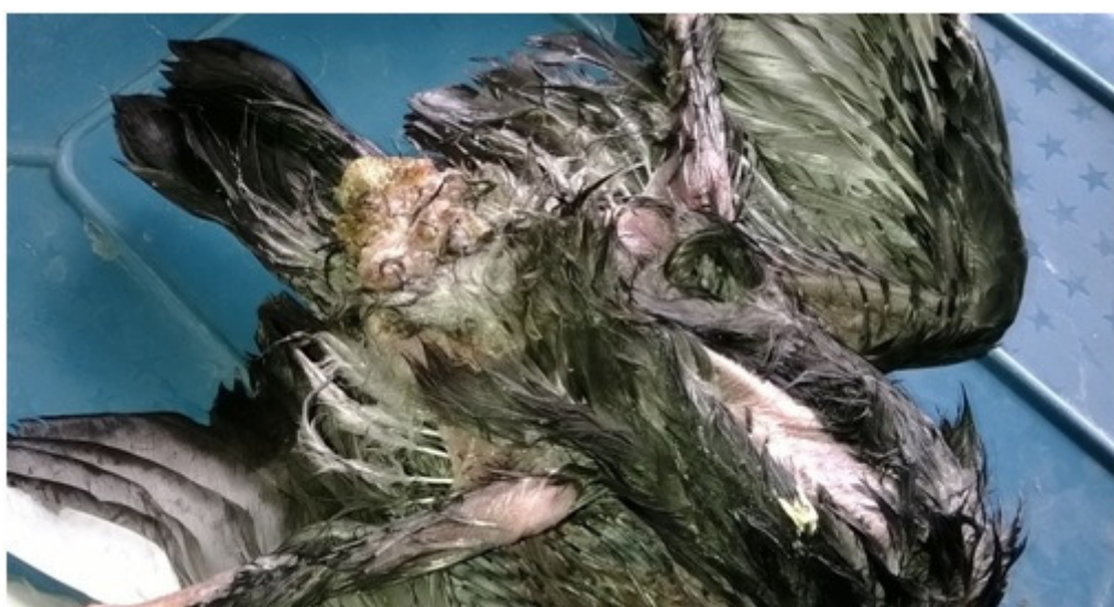
Fig. 2: Grayish white coalescing nodular lesions around the cloaca.