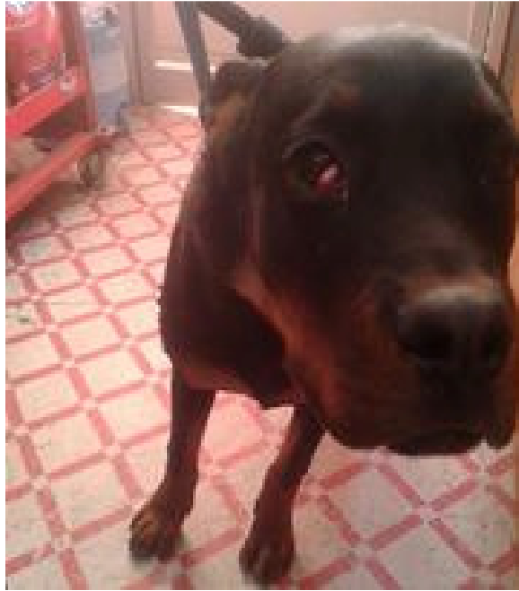
Dog with cherry eye condition