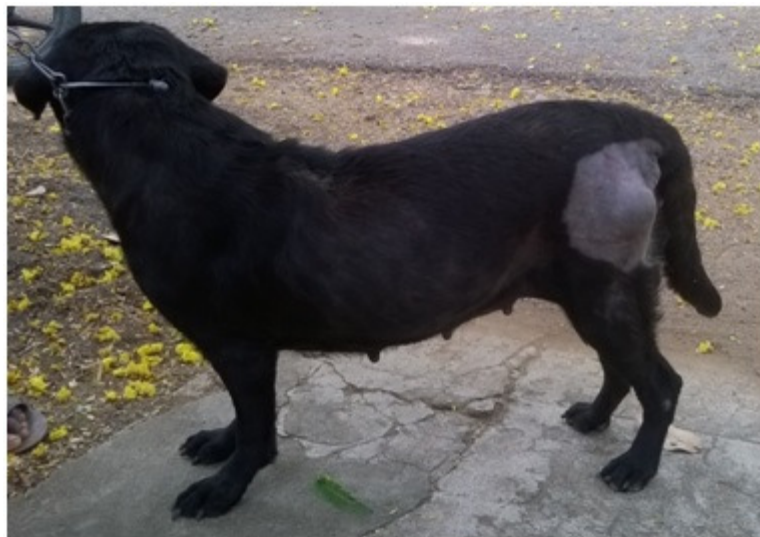
Fig: 1 semi solid tumour mass in the left thigh region