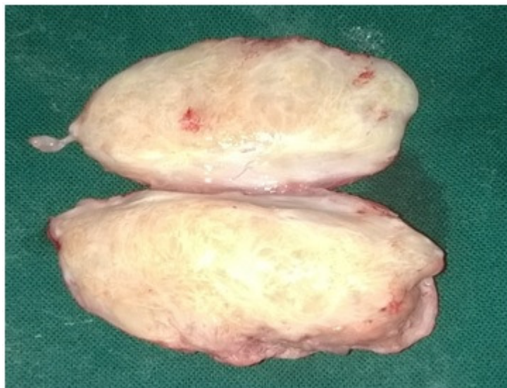
Fig: 2 Mass from thigh after removal