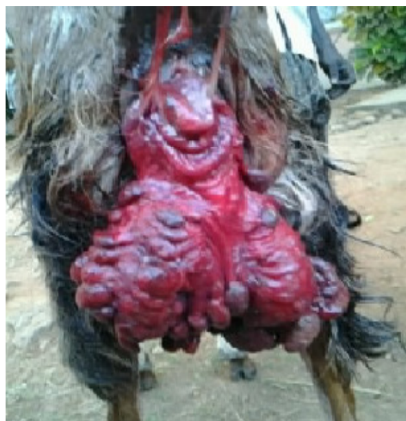
Fig. 1: Bicornual Uterine prolapsed