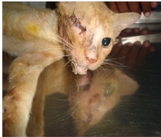
Fig 2 Proptosis eye after tarsorrhaphy